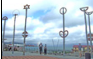
Wellington City to Sea Bridge